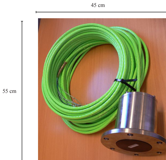
Height: 17 cm Diameter of cable 10.6 mm